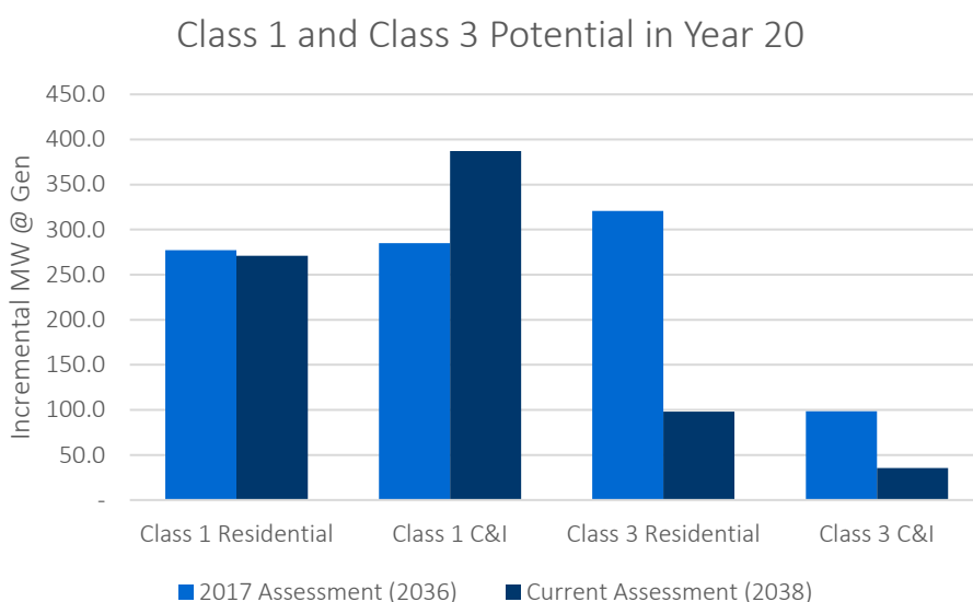
Figure 2-2 Comparison of 20-Year Class 1 and Class 3 Incremental Potential with Prior CPA (Summer Peak MW)

For the Class 1 and Class 3 DSM analysis, the following aspects of the current analysis served as key drivers of changes: